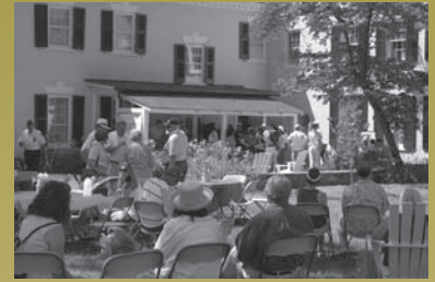
Visitors enjoy ice cream and shade at Dodona on July 4th.

What does it take to cool one of the hottest July 4th celebrations in recent Leesburg history?