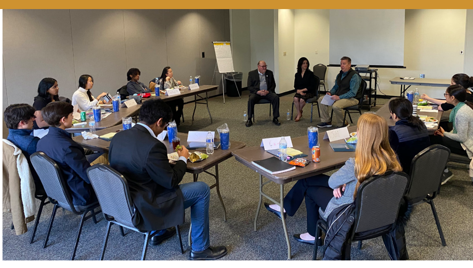
Students listen to the lunchtime panel discussion

Stay tuned for information on the fall edition of Five-Star Character! Interested students and families can learn more at georgecmarshall.org/elc.★