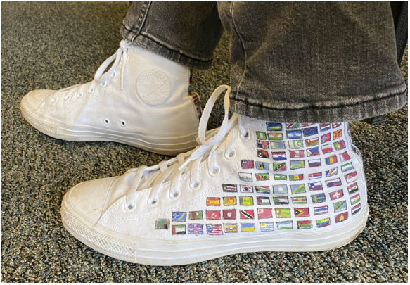
Custom sneakers sported by a student