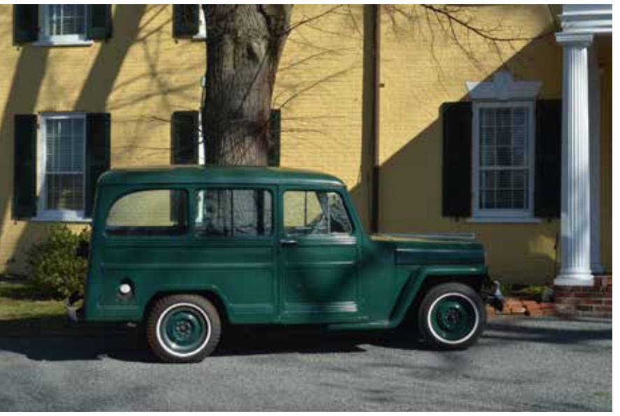
The replica green Willys Jeep Station Wagon outside Dodona Manor. resources to this effort.

Aunique gem preserved as a living reminder of General Marshall's inspiring legacy, Dodona Manor provides visitors an opportunity to revisit a moment in time when American leadership saved democracy and preserved peace during troubled times.