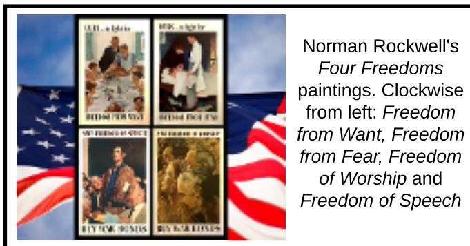
Norman Rockwell's Four Freedoms paintings. Clockwise from left: Freedom from Want , Freedom from Fear , Freedom of Worship and Freedom of Speech

"Four Freedoms," four oil paintings reproduced in The Saturday Evening Post and used in sales drives of war bonds.