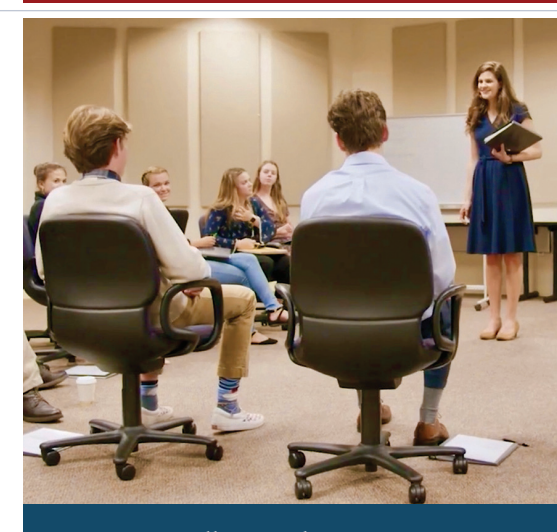
Small group discussion at Ethical Leadership Conference

The Marshall Center is constantly innovating to fulfill our motto of "Inspiring Leadership." Our Ethical Leadership Program offers a growing set of educational seminars – built on the solid framework of Selfless Service, Unwavering Integrity and Visionary Leadership. From high school students to corporate executives, we inspire leaders of today and tomorrow to act within a solid ethical framework. We deploy a robust set of communications tools to reach current supporters and inform new audiences of our work.